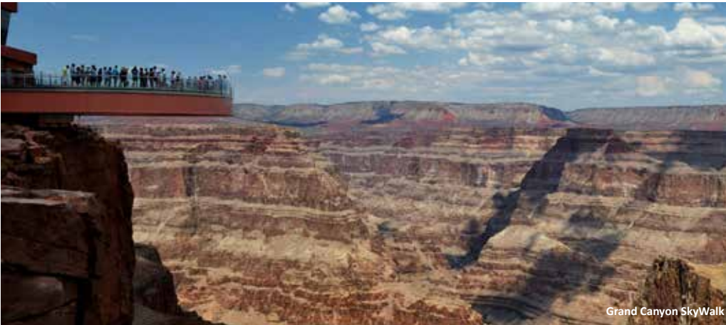
Grand Canyon SkyWalk

region of contrasts, from the Mojave Desert at 2,000 feet to the 10,000-foot Pine Valley Mountains. The crown jewel of the area is Zion National Park , one of the oldest & most scenic National Parks in the United States. Enter the park in Springdale and experience a Zion Park Tram Tour to view the spectacular combination of multicolored canyons, sheer cliffs, streams, waterfalls and foliage that are all part of this beautiful park's backdrop. Later visit the historic Zion Lodge, the hub of this wonderful National Park. After your Zion experience, enjoy a Farewell Dinner at a local restaurant in the Zion Park area. After dinner return to Mesquite.